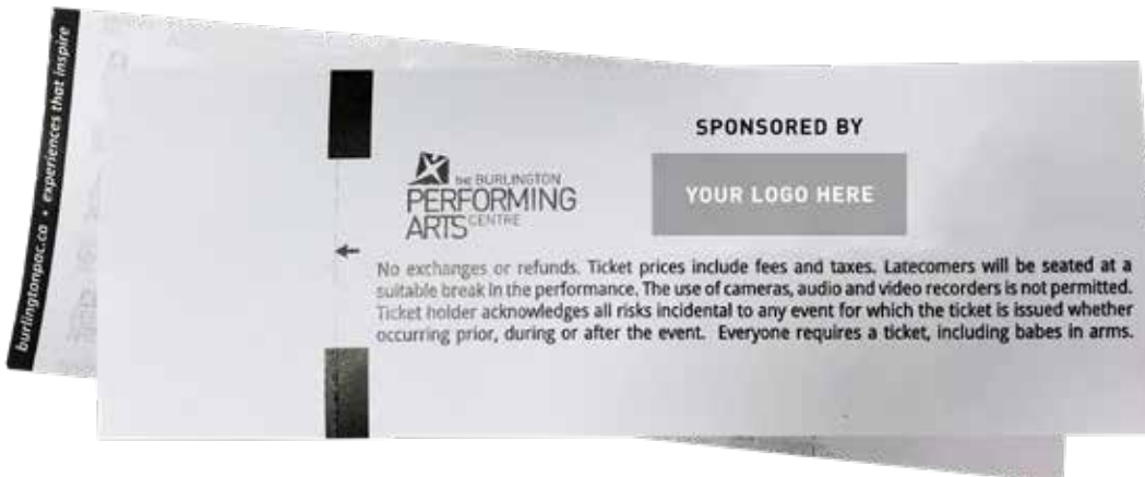
Sample of BPAC ticket showing sponsorship opportunities.