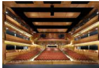
MAIN THEATRE Seating capacity: 718