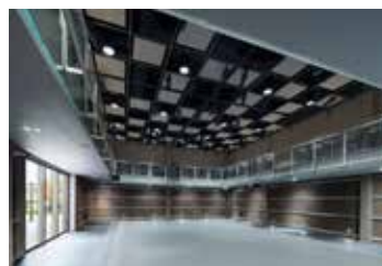
COMMUNITY STUDIO THEATRE Seating capacity: 160