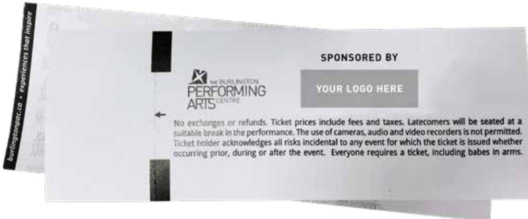
Sample of BPAC ticket showing sponsorship opportunities.